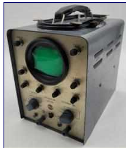
Figure 1 : RCA WO-33A Oscilloscope (with graticule)

Not too long ago, I picked up a well-used three-inch oscilloscope, an RCA WO-33A unit (Figure 1) , with the expressed intention of converting this 'scope into another piece of test equipment, namely a graphic semiconductor curve tracer. The main working parts of the 'scope would remain untouched, but an additional small power supply and a circuit board would be added in to provide the new functions that I wanted. The oscilloscope had its rubber bezel, but it did not have a graticule. This did not make any difference, because the graticule is not specifically needed for the curve tracer to operate acceptably. Down the road, I may make a new graticule out of some colored acetate sheeting onto which I can imprint a grid and scale, but that is another project.