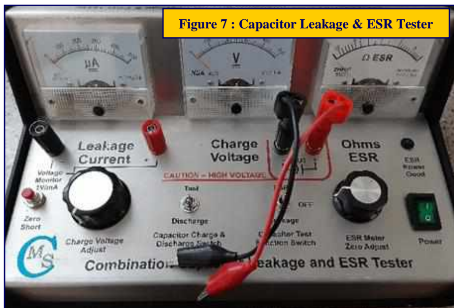
Figure 7 : Capacitor Leakage & ESR Tester