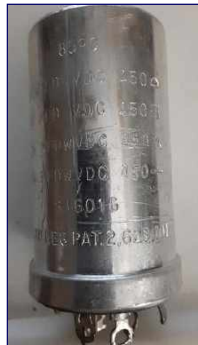
Figure 8 : Original C38 Capacitor

The replacement devices are the product of CE Manufacturing of Tempe, Arizona. CE Manufacturing produces a fairly extensive product range of multi-section can-type electrolytic filter capacitors, intended primarily as replacements for guitar amplifiers and older radio receivers. I have used their capacitors in several refurbishing projects over the past few years, always with great success. They are drop-in replacements as far as size, pinout, and appearance are all concerned.