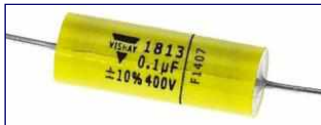
Figure 5 : MKT1813 0.1 \mu F 400VDC Capacitor

After replacement of the capacitors, I decided to investigate the exact condition of the capacitors that I had removed. I did this using a capacitor tester of my own design and build ( Figure 7 ), which tests capacitors for leakage and for ESR. What I found, detailed in Table 1 , is quite revealing.