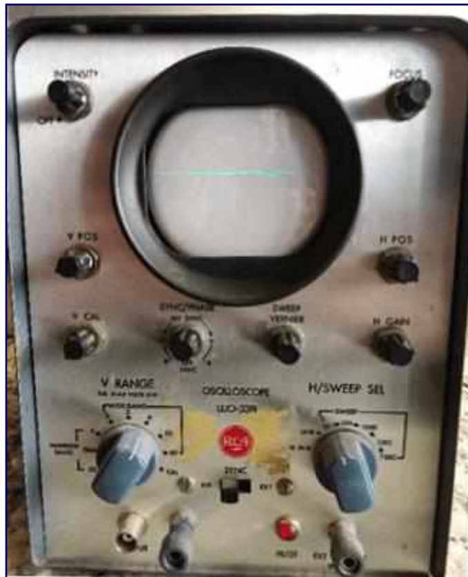
Figure 12 : Working Oscilloscope

With the repairs and cleaning completed, it was time to pay some attention to the external appearance of the unit. This turned out to be a relatively minor issue, as the blue paint which had been splattered across the front panel, the upper surface, and the left side panel all came off with some acetone on a soft cloth. The remainder of the stains and debris on the enclosure all came off with some denatured alcohol and another soft cloth, using an old toothbrush to scrub the corners and crevices. A final wipe-down of the front panel with the denatured alcohol finished the clean-up of the unit, though I still need to find a way to safely remove some tape residue without damaging the RCA logo, as can be seen in the Figure 12 photo.