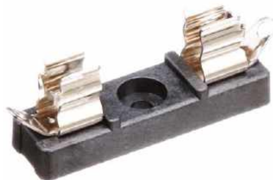
Figure 11 : Keystone 3523 Fuse Holder

This oscilloscope, like many appliances of that era, did not have a fuse installed at the time of initial build. However, I am not of a mind to trust in the circuit designs of a bygone era for overload protection, so I decided to add a fuse to the ‘scope power inlet circuit. I mounted a standard 1/4” x 1-1/4” snap-in fuse holder ( Figure 11 ) to the inside of the left side (from the rear) chassis panel, wiring the fuse in series with the power switch in the LINE lead of the power cord. As to the fuse value, I opted for a 1250mA (1.25A) slow-blow fuse. This provides adequate over-current protection while allowing for the momentary current surge at start-up.