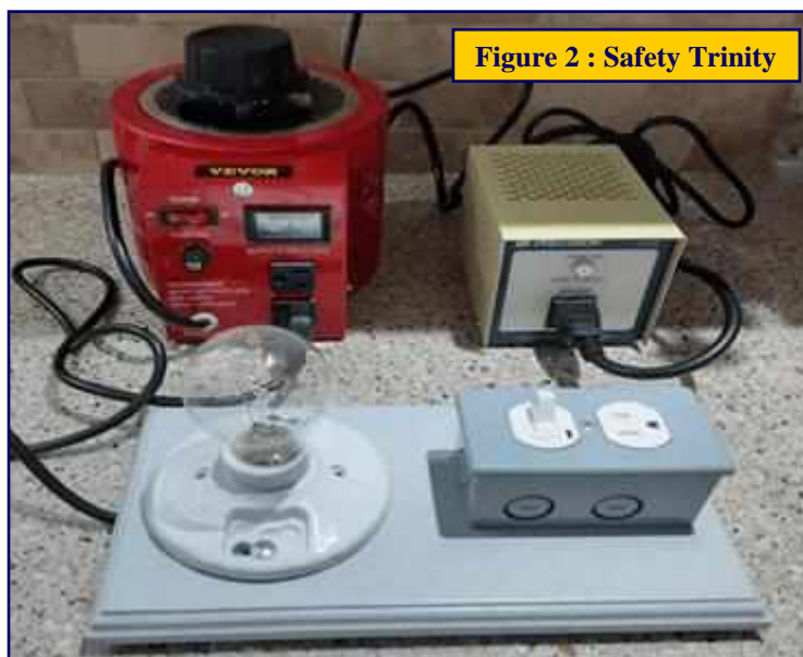
Figure 2 : Safety Trinity

All of these were minor issues in the overall scheme of things. Far more important to me was the electrical condition of the unit. I removed the 'scope from its cabinet and I hooked it up to what I call my "safety trinity" (Figure 2) - my dim bulb current limiter, my Variac™, and my isolation transformer to see what it would do. When I powered it on, the dim bulb went to full brightness and just stayed there, never dimming as it should have done if the 'scope were intact electrically. This indicated either a direct short circuit from line to neutral, or else some severe capacitor leakage.