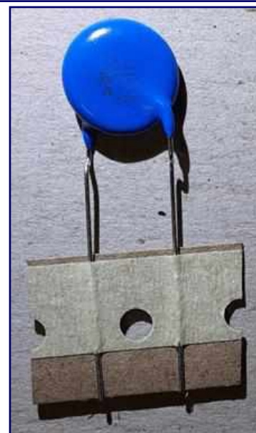
Figure 10 : 0.01 \mu F Safety Capacitor

Continuing with the capacitor specifications shown for the safety capacitors, the “±20%” is the tolerance of the capacitor, or the variation from the nominal value within which the capacitor will fall. Thus, the 0.01 \mu F capacitor will be found to be within the range of 0.008 \mu F to 0.012 \mu F. Finally, the “Y5V” is the designator for the dielectric used in construction of the capacitor. Disc capacitor dielectrics are assigned alphanumeric codes that describe the properties of that dielectric compound. Each of the three characters conveys a specific meaning. In this case, the “Y” indicates that the lowest temperature for which this capacitor is rated is -30°C (-22°F). The “5” indicates that the highest temperature for which this capacitor is rated is +85°C (+185°F). Finally, the “V” tells us that the amount of capacitance change over the temperature range is +22% to -82% of the nominal value. A table of the common dielectrics and their meanings can be found in the article Capacitor Markings and Identification, a part of my Basic Electronics Series, which can be found on my website at https://www.ad2cs.com/electronics-articles-and-publications . Please feel free to browse through the website and have a look at the many articles and publications found there.