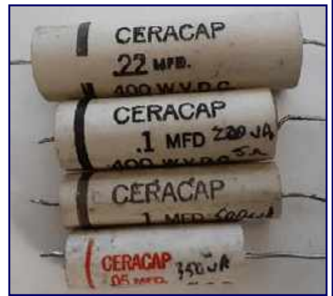
Figure 3 : CERACAP Examples

Anyway, the capacitors that I believe were all factory components were all of a type - ceramic tubes with wax filling, all marked as being CERACAP devices ( Figure 3 ) from American Radionic Company, Incorporated. Some research showed that American Radionic is still around today, located now in Palm Coast, Florida, some sixty miles south of Jacksonville, where they relocated after leaving Danbury, Connecticut in the late 1980's. Their AmRad line of motor-run capacitors are considered to be world-class products. However, in the 1950's and 1960's, they were a major supplier of wax and paper capacitors to consumer TV and radio manufacturers.