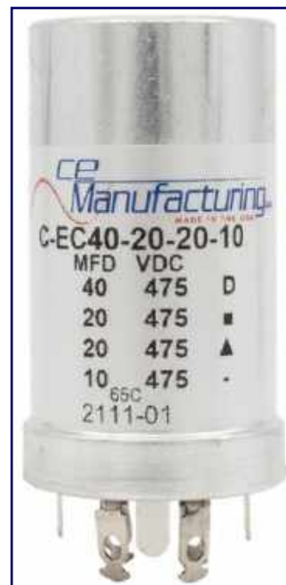
Figure 9 : Capacitor Label

The 'scope required replacement of its power cord because of the condition of the existing cord, as mentioned earlier. I replaced the cord with a two-prong polarized power cord, placing the LINE lead in series with the power switch, identified only as "POWER SWITCH" and ganged to the 75k \Omega INTENSITY potentiometer R73. At that time, I also added the two 0.01 \mu F capacitors from the power cord leads to the chassis. The capacitors I used are X1-440V/Y2-300V \pm 20% Y5V ceramic disc safety capacitors ( Figure 10 ). Safety capacitors are specially designed so as to fail, when failure occurs, in the "open" state rather than failing "shorted". This is important in any capacitor placed across the power line or placed between the power line and chassis (or other) ground.