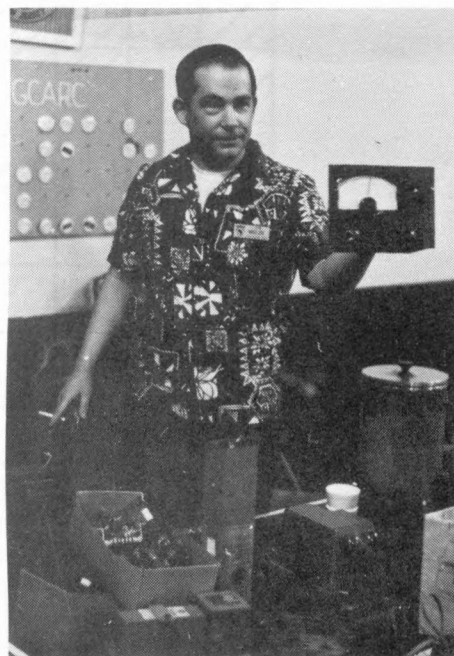
VFO anyone? How 'bout a quarter?