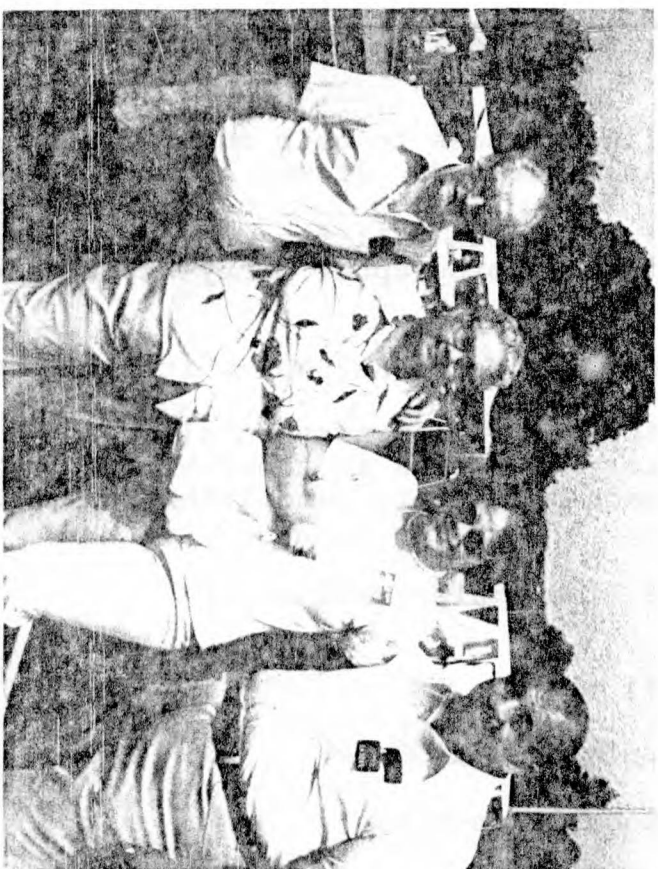
KA3DXQ-Geo & Filly Kopteros-Bristol, Pa. WB3JGJ-Mae